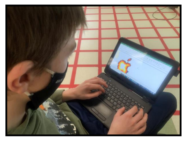
The Wearing of The Green